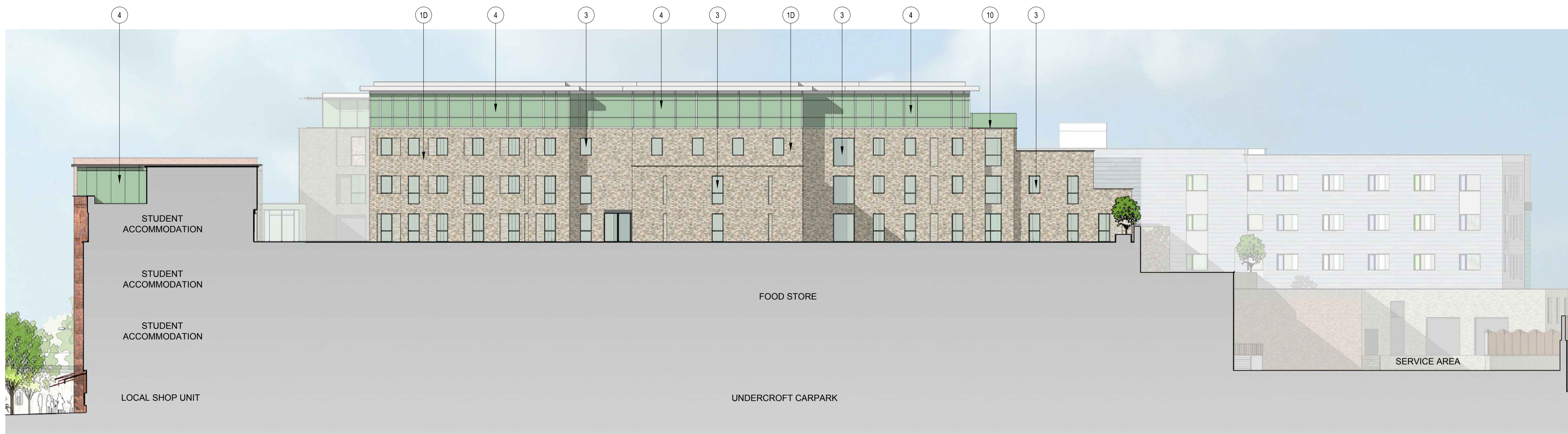
ELEVATION 22 (BLOCK B INTERNAL ELEVATION LOOKING NORTH-EAST)

© Mountford Pigott LLP 2012 Reproduction in whole or in part by any means is prohibited without the prior permission of Mountford Pigott LLP. This drawing is only to the stated scale if it is printed correctly. MPLLP cannot accept responsibility for the incorrect scaling of drawings printed by third parties. All dimensions are in mm unless otherwise stated. If this drawing forms part of an application for planning permission on behalf of the applicant named below, it shall not be used for any other purpose without the express permission of Mountford Pigott LLP. This drawing may incorporate information from other professionals. Mountford Pigott LLP cannot accept responsibility for the integrity and accuracy of such information. Any clarification and/or additions that are required appertaining to such information should be sought from the relevant profession or their appointment representative as listed below.