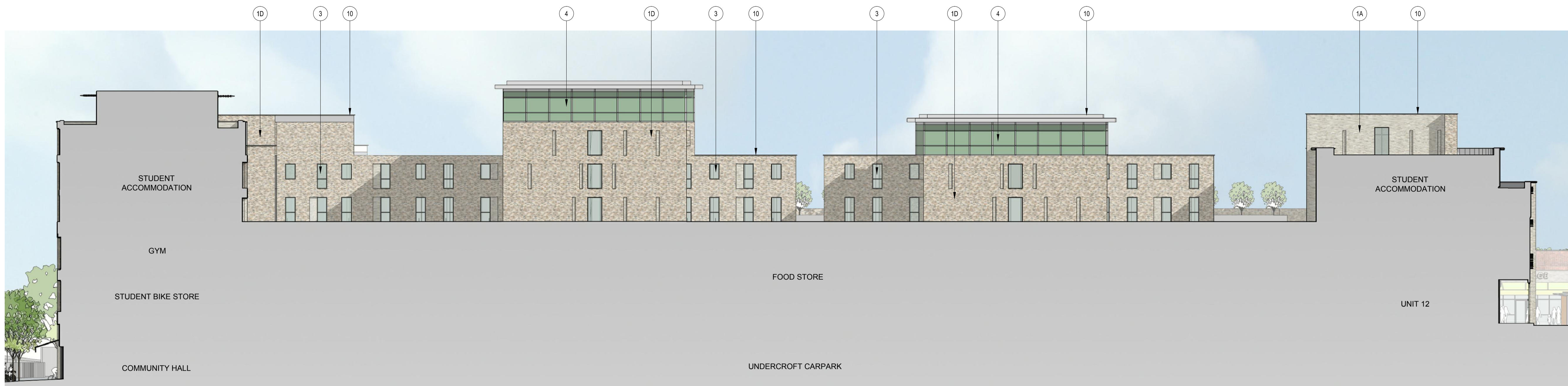
ELEVATION 20 (BLOCK B INTERNAL ELEVATION LOOKING SOUTH-EAST)