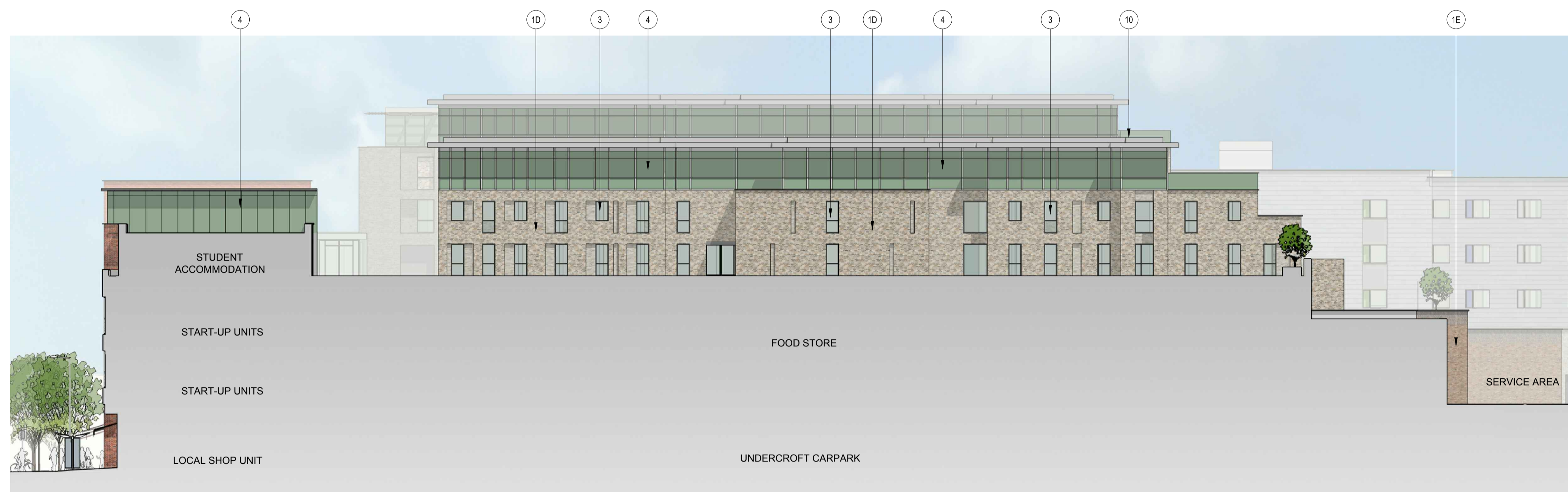
ELEVATION 21 (BLOCK B INTERNAL ELEVATION LOOKING NORTH-EAST)